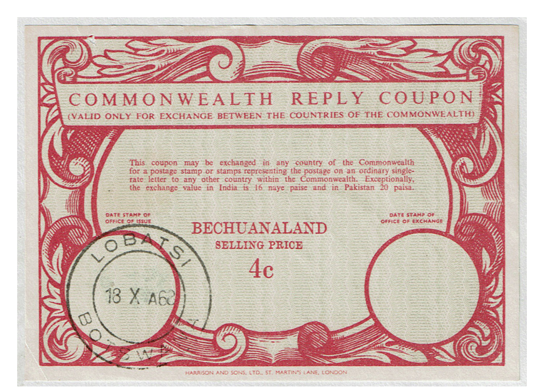
Bechuanaland Commonwealth Reply Coupon used in Lobatsi in 1968 just after independence