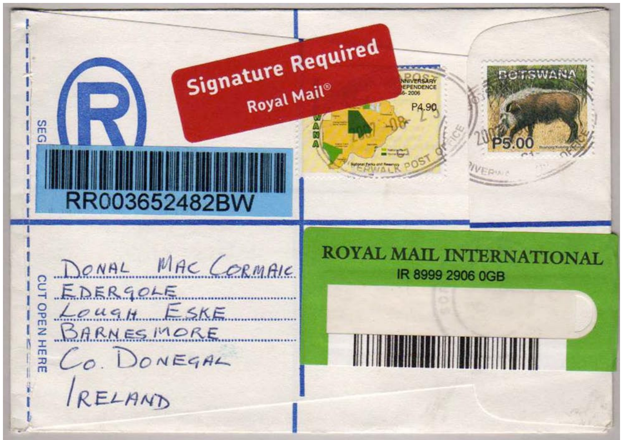
A 2007 registered letter bearing a blue registration barcode label

have already heard the explanation of the rectangular mark. Can any member help refresh my memory?