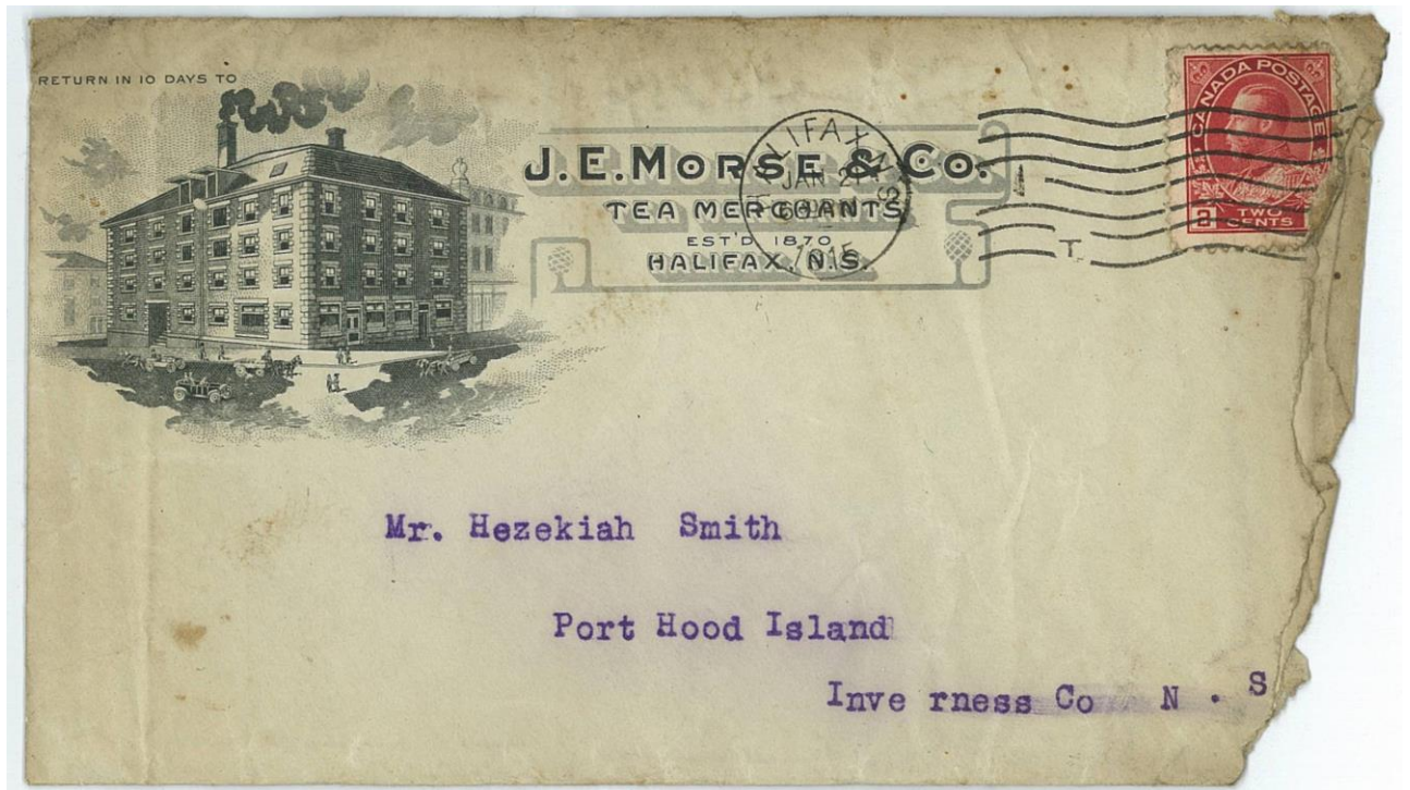
Cover Postmarked 1915