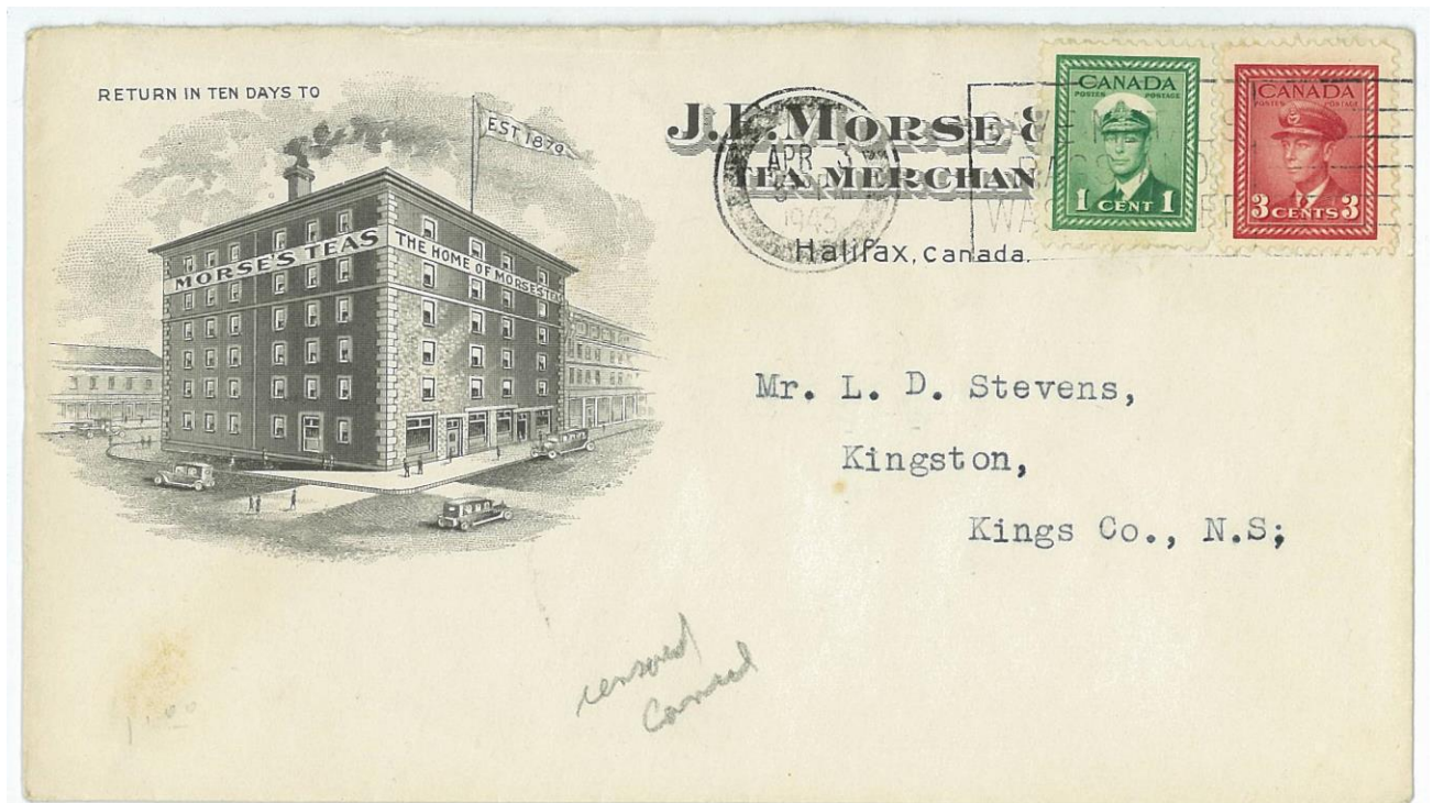
Cover Postmarked 1942 (earliest known postmark is 1933)

It is interesting to note how the illustrations track the changes in the building. Note the addition of the new floors and the changes to the roofline as shown in the 1942 cover as compared to the 1928 cover. This is how the building located on the northern edge of downtown Halifax, where Hollis and Upper Water Streets merge.