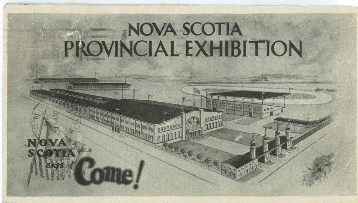
Front and Back of NS Exhibition Cover Postmarked 1928

NOTE THE EXHIBITION DATES—AUG. 25 TO SEPT. 1