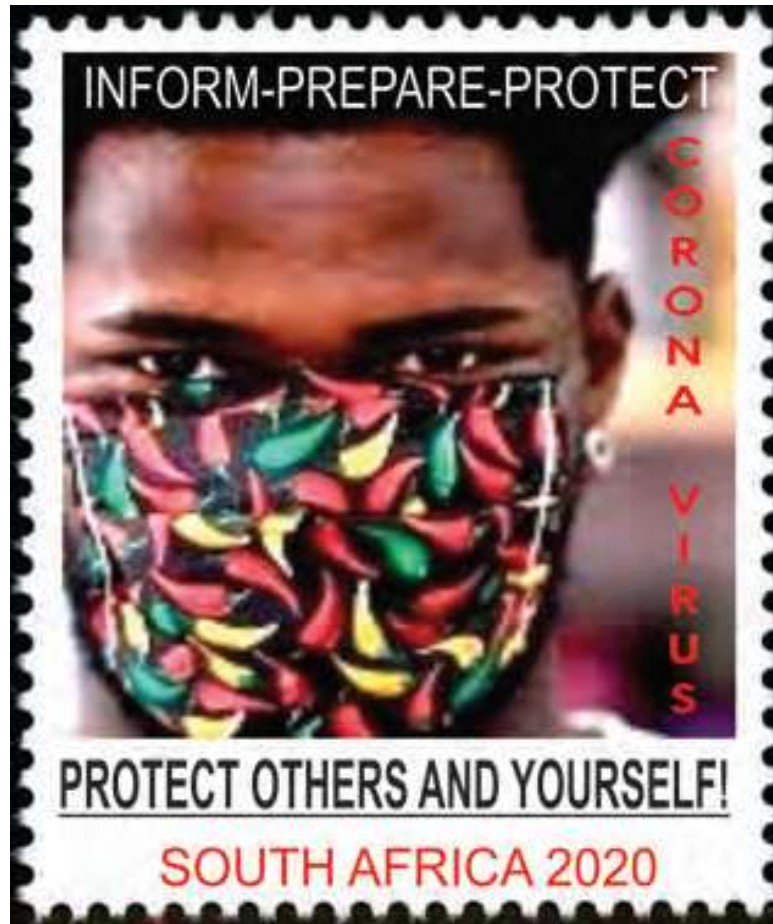
Pandemic label designed by Volker Janssen (see page 62)