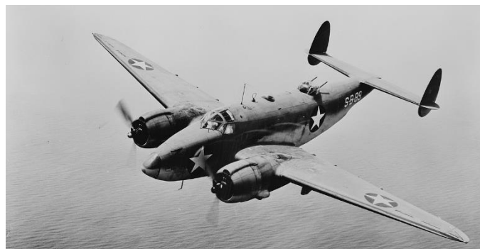
Figure 5: Lockheed PV-1 Ventura