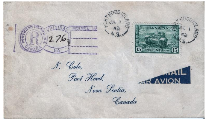
Figure 3: First Day Cover of 13¢ Ram Tank stamp

Curious about the Rev. Cole as the creator of these covers, wondering where else he may have served as a minister and created other philatelic covers, I reached out to the United Church Fundy St. Lawrence Dawning Waters Regional Council and Regional Council 15 Archives in Sackville, NB. The