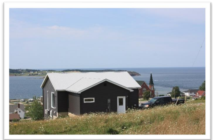
View 4: from the top of Reynolds St.