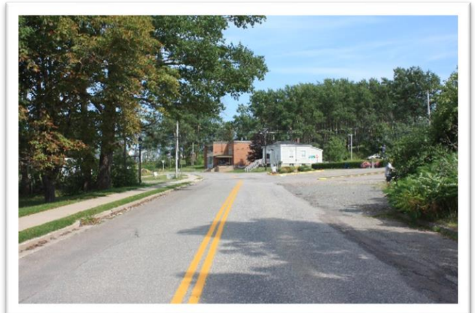
View 2: "Post Office Square" from the south