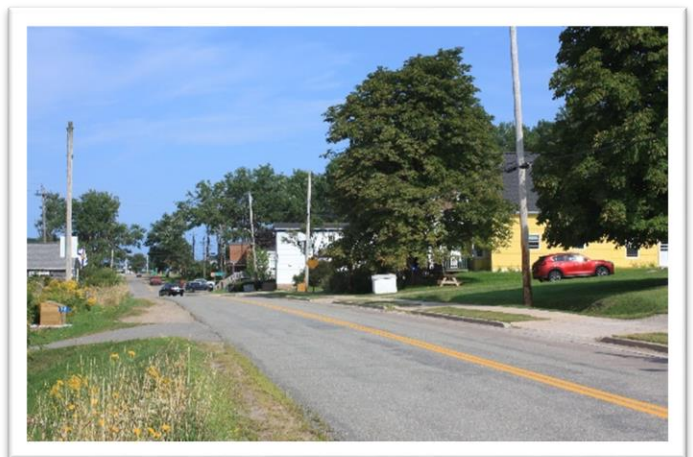
View 1: 38 High Road