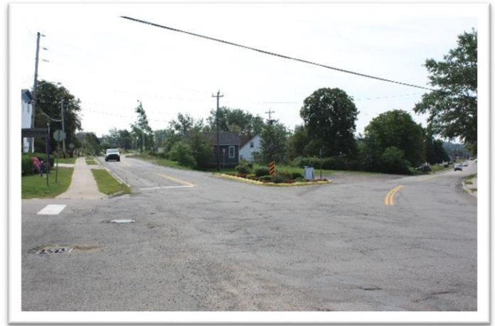
View 3: "Post Office Square" from the north