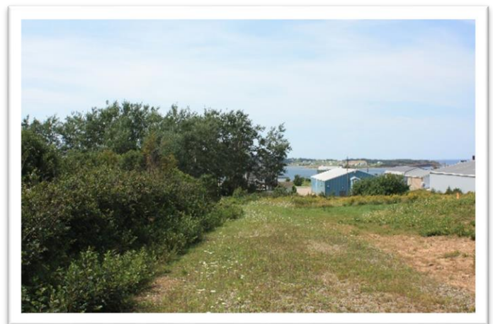
View 5: from field above the fire department