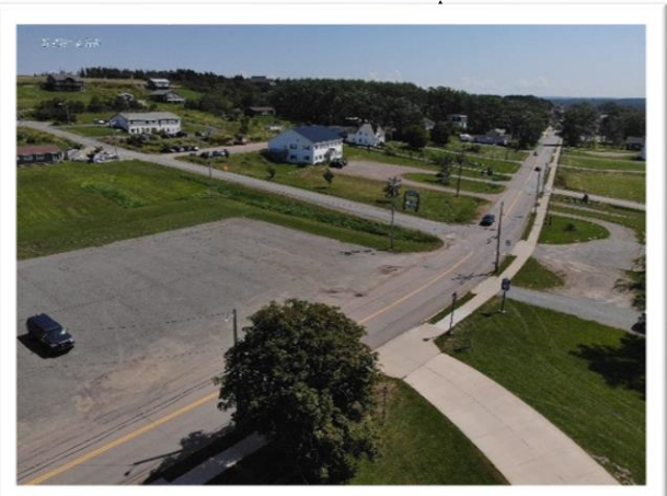
View 4: Port Hood looking South from Convent