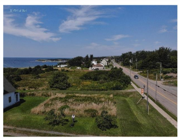
View 3: Port Hood looking North from Convent