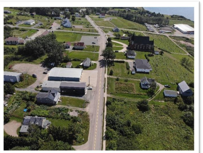
View 2: Looking South - southeast along Main St.