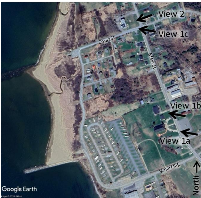
Map of Port Hood showing Views 1 and 2.