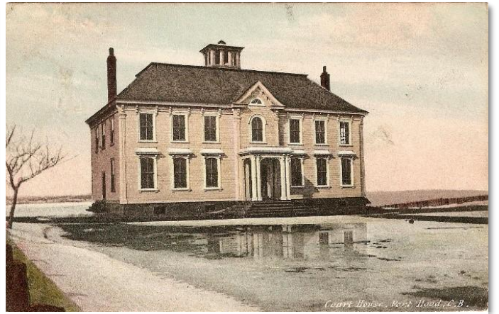
View c: Court House

Individual postcards using images from postcard in View 1.