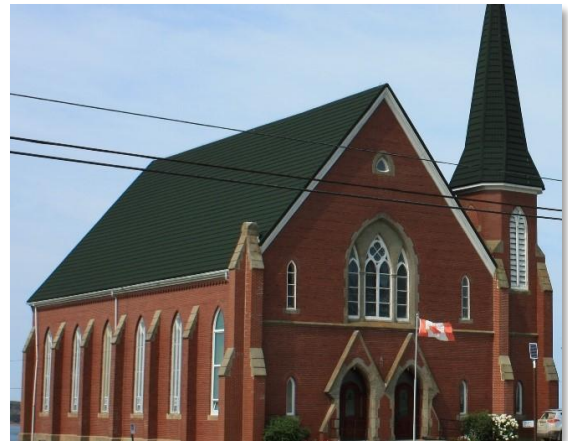
View 1a: Catholic Church, 2021