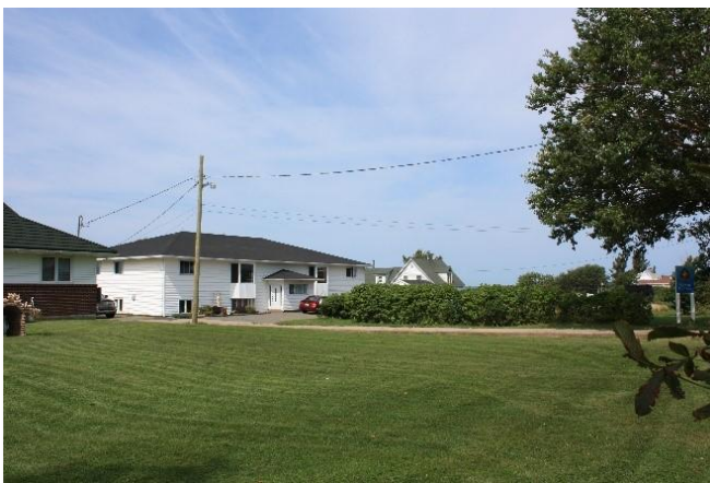
View 1b: Convent, 2021