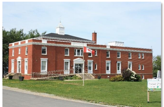
View 1c: County Court House, 2021

View 1: Postcard showing individual photos of important buildings in Port Hood.