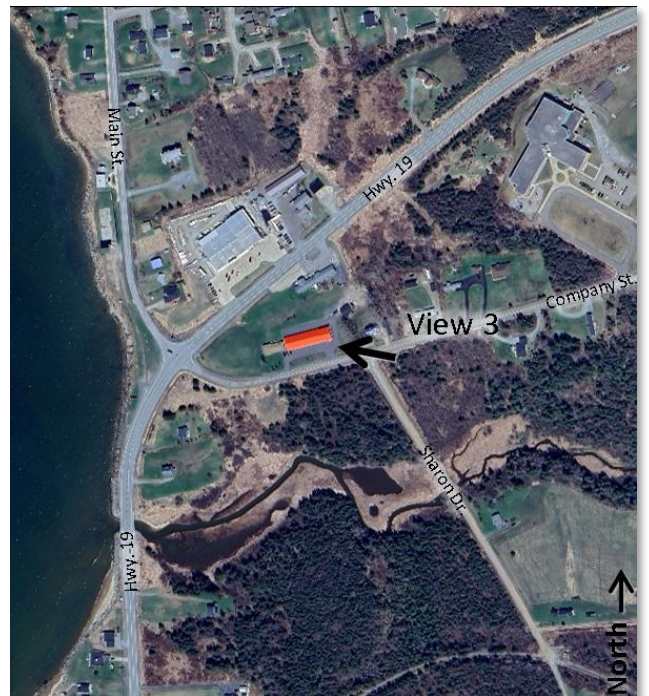
Map of Port Hood showing View 3.